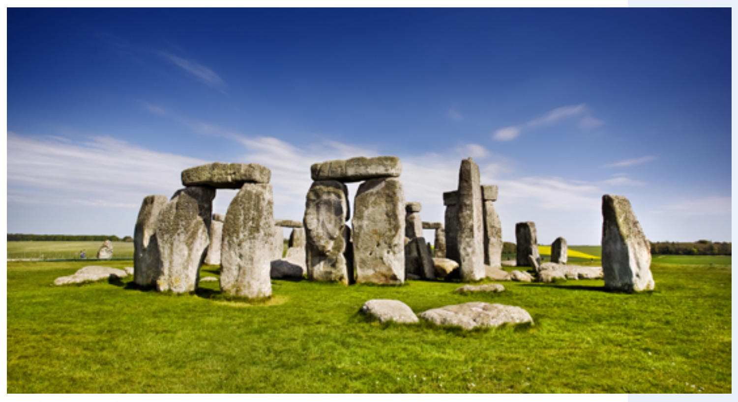
Stonehenge - Amesbury, Wiltshire