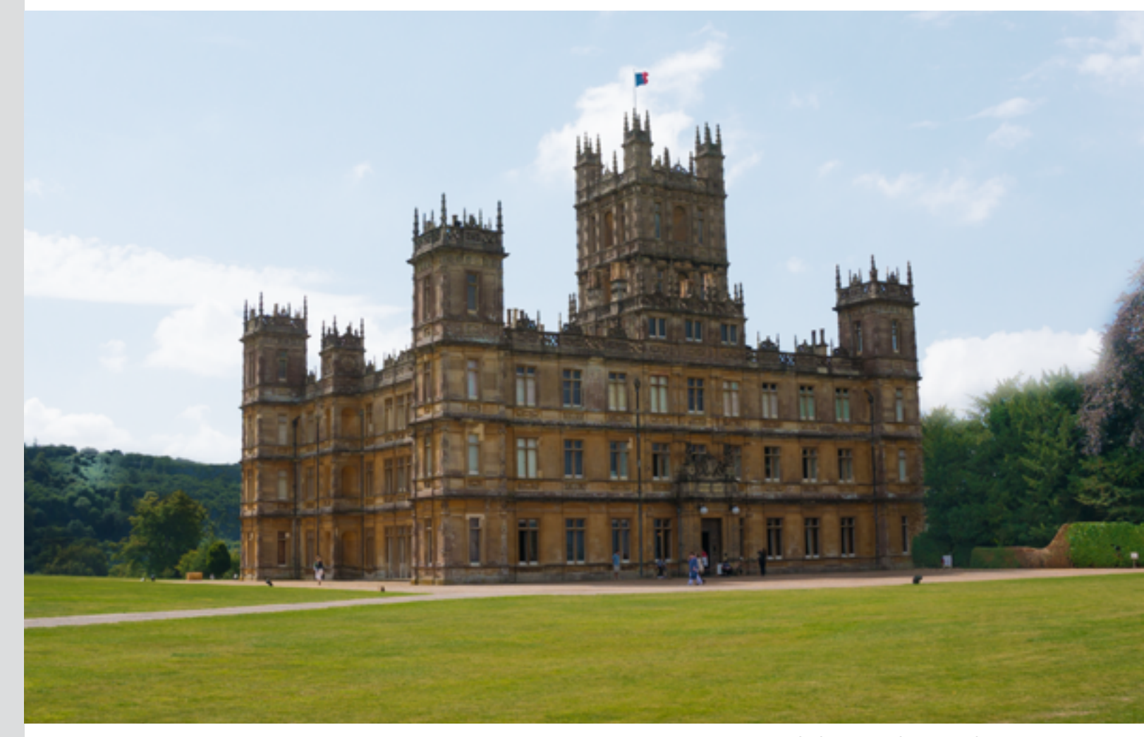
Highclere Castle - Newbury

Soccer fans can also enjoy the sport in the country where 'football' began, and watch stars of the EPL, the most watched football league in the world<sup>5</sup>, every week live in stadiums around the UK.